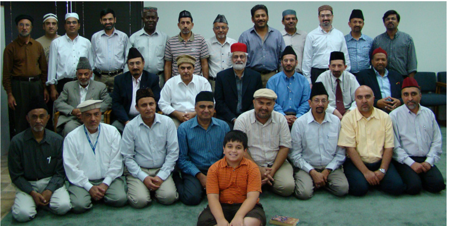
Members of Georgia-South Carolina Majlis with members of Ansār National Āmila

Many people put off making a will; but if someone passes away without having a will, his assets may be distributed according to the law rather than his wishes. It is prudent to make a will to protect one's family. Ansār are encouraged to make will in order to save their loved ones from disputes and unpleasant situations.